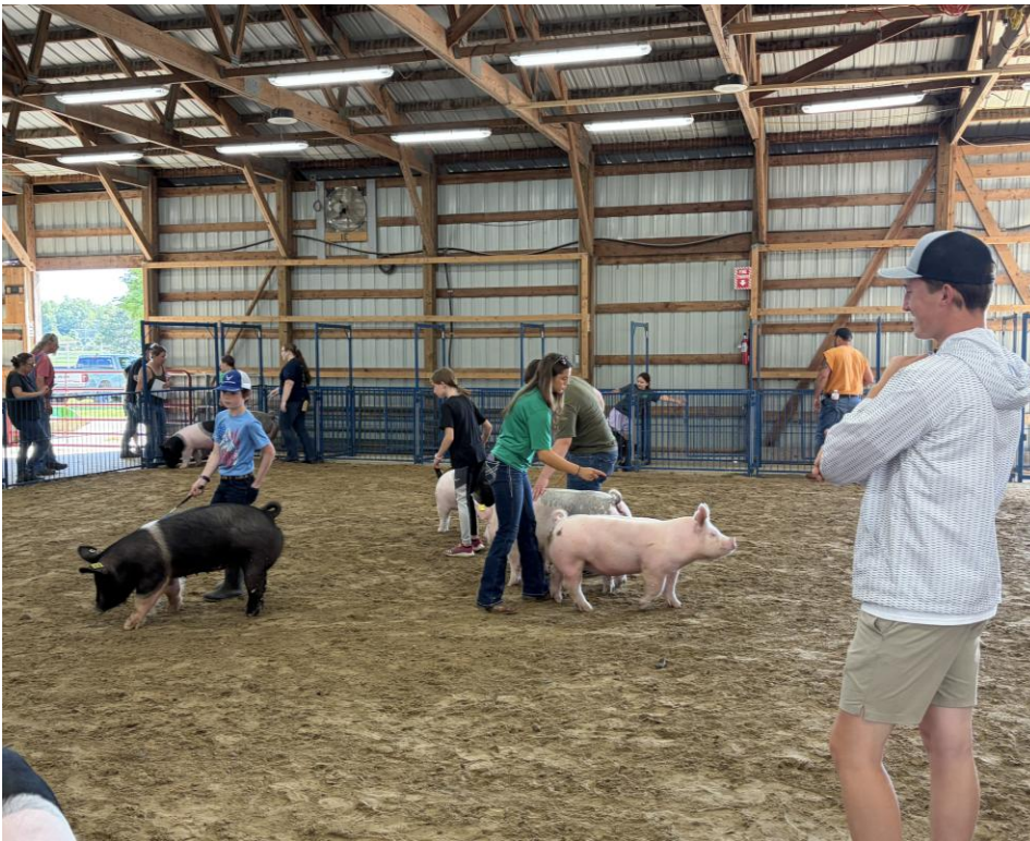
Show Me the Showmanship Swine Clinic was held at the Armada Fairgrounds in Armada on Sunday, June 28 th .